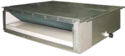
HUCGM 260-350-530 Z