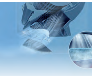
MULTIPORE TECHNOLOGY TOP