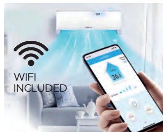
SMART MANAGEMENT WITH WIFI APP SMARTLIFE