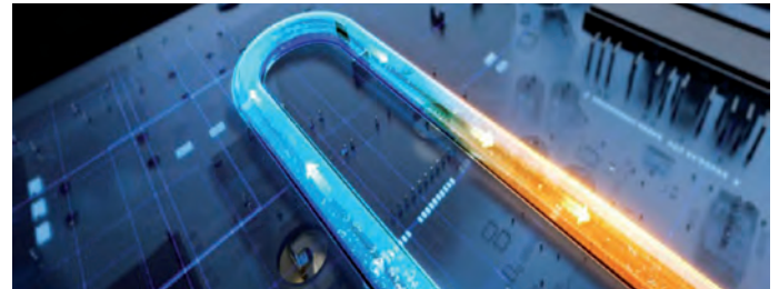
PCB OF THE OUTDOOR UNIT COOLED BY REFRIGERANT