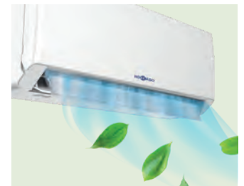
EFFECTIVE AGAINST VIRUSES AND BACTERIA