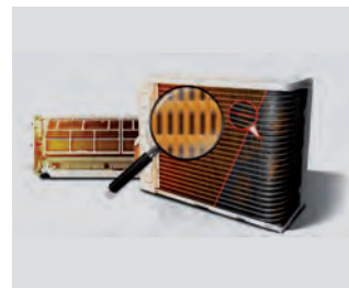
HEAT EXCHANGER TREATED WITH ANTI-CORROSION COATING